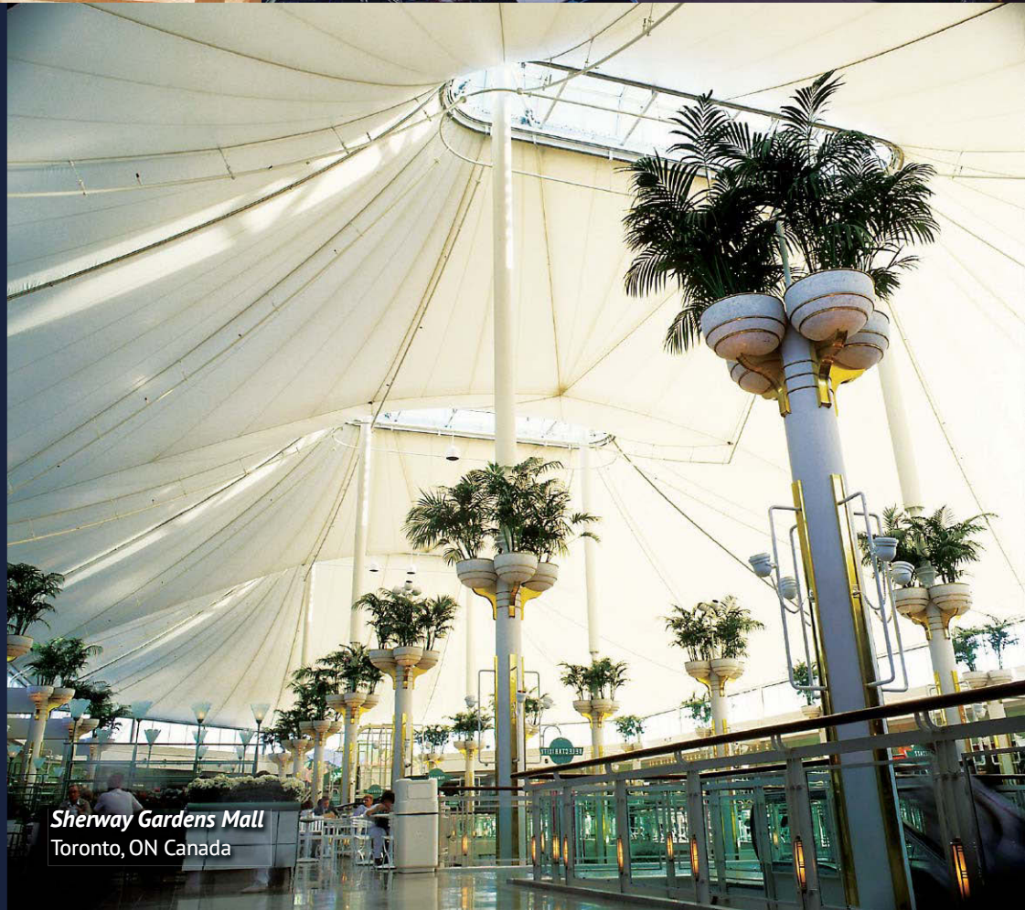
Sherway Gardens Mall Toronto, ON Canada

Birdair offers a selection of architectural fabric membranes, including PTFE fiberglass, ETFE film, PVC and Tensotherm™, an insulated and translucent tensioned membrane system.