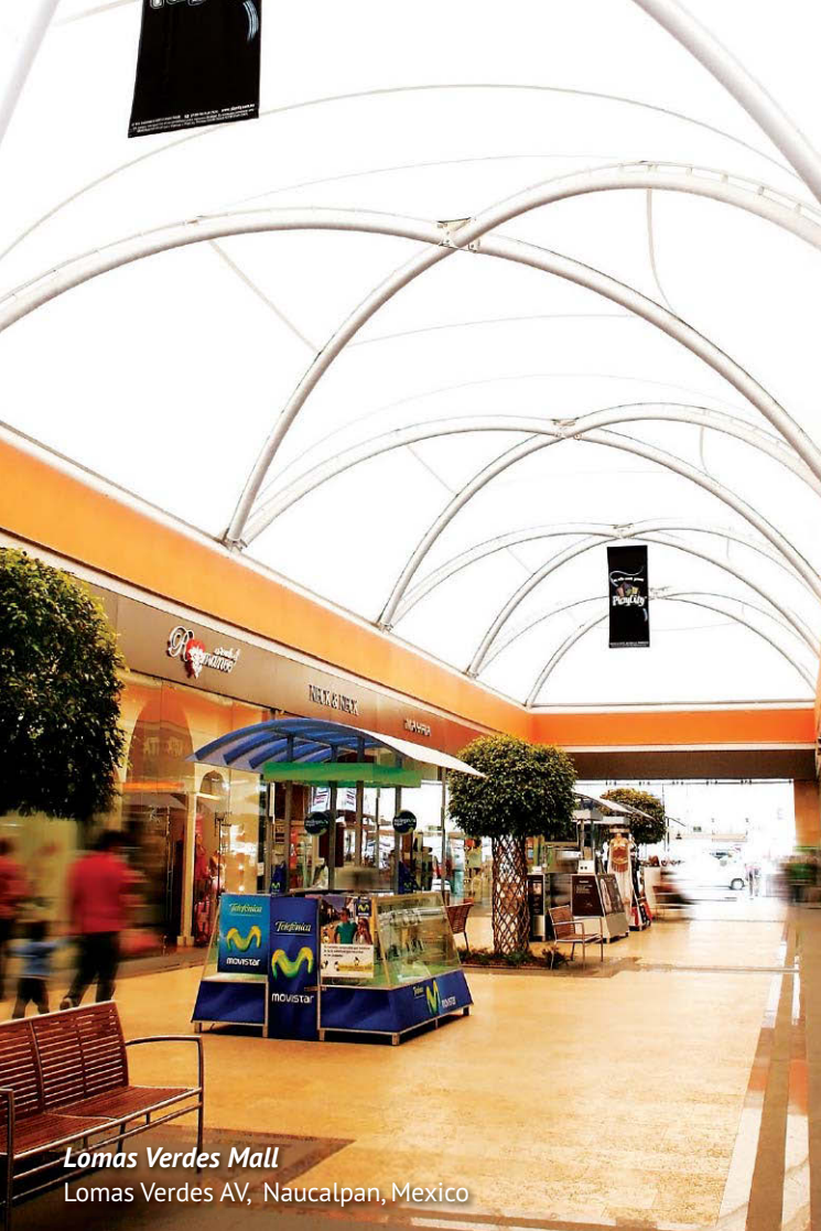
Lomas Verdes Mall Lomas Verdes AV, Naucalpan, Mexico