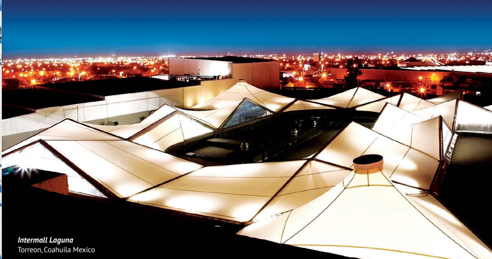
Intermall Laguna Torreon, Coahuila Mexico