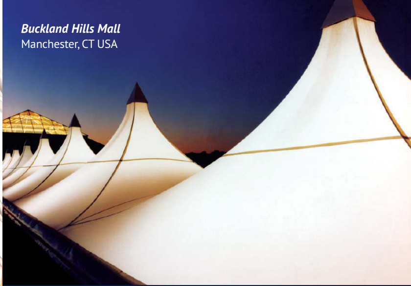
Buckland Hills Mall Manchester, CT USA