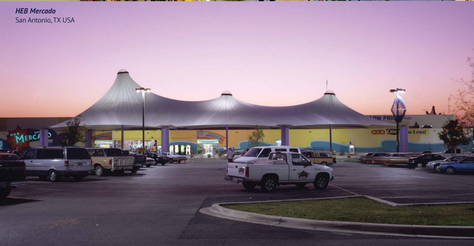
HEB Mercado San Antonio, TX USA