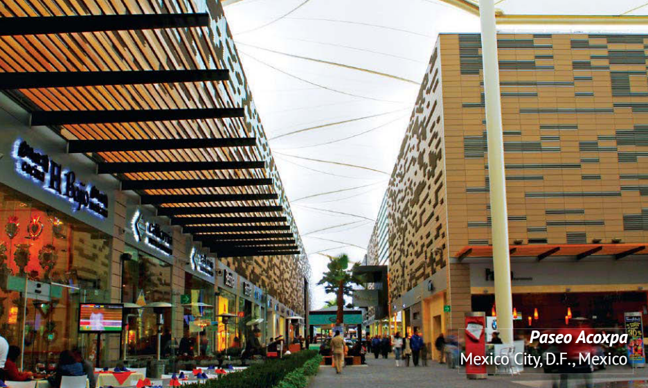
Paseo Acoxpa Mexico City, D.F., Mexico