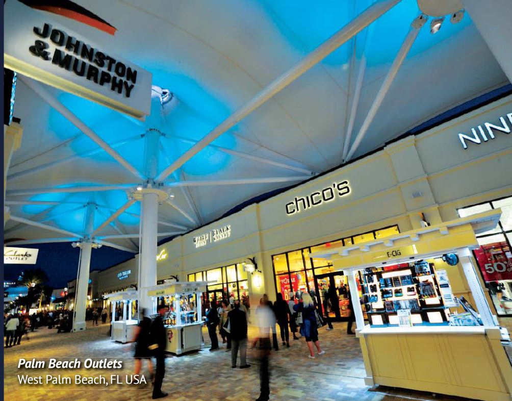
Palm Beach Outlets West Palm Beach, FL USA

Birdair fabric membrane roofs benefit the retail industry by providing ample natural light, minimizing energy costs by lowering the demand for indoor lighting. More importantly, it creates a bright and cheery atmosphere.