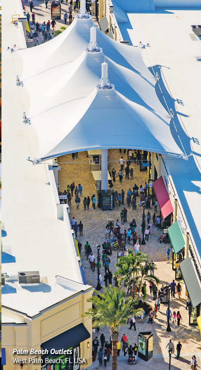
Palm Beach Outlets West Palm Beach, FL USA