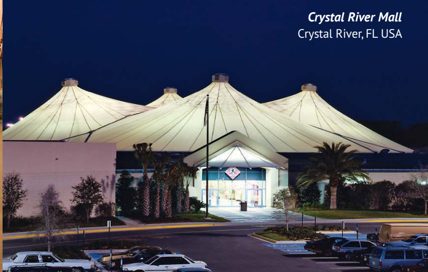
Crystal River Mall Crystal River, FL USA