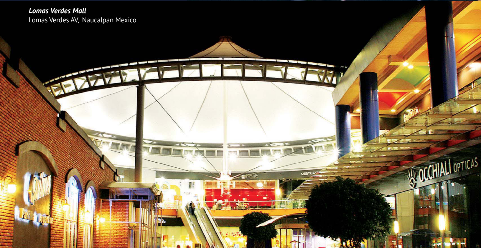
Lomas Verdes Mall Lomas Verdes AV, Naucalpan Mexico