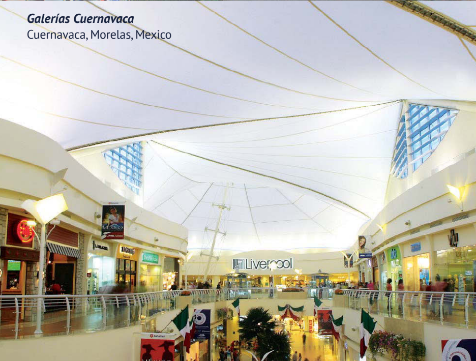
Galerías Cuernavaca Cuernavaca, Morelas, Mexico