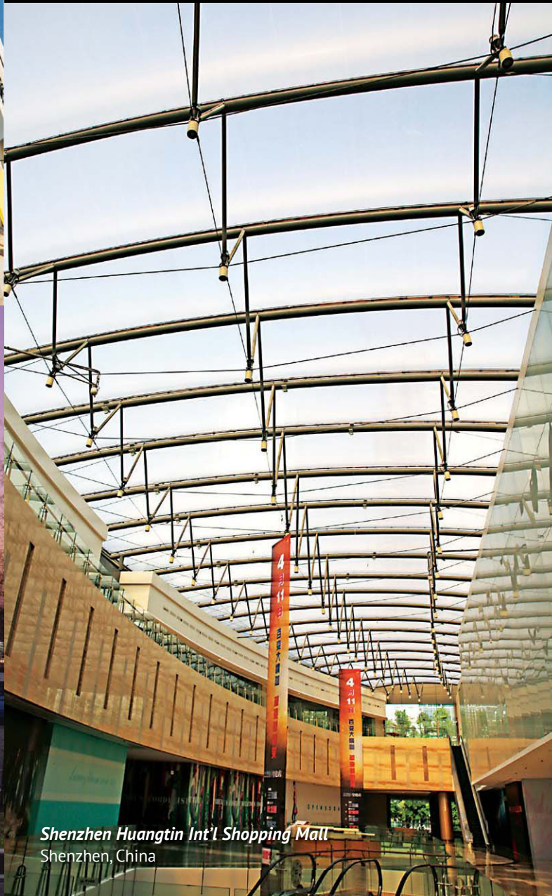
Shenzhen Huangtin Int'l Shopping Mall Shenzhen, China