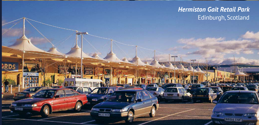
Hermiston Gait Retail Park Edinburgh, Scotland