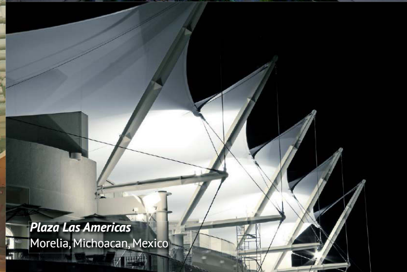
Plaza Las Americas Morelia, Michoacan, Mexico